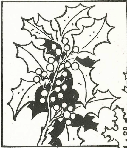
HOLLY BRANCH AND BERRIES